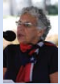
Commissioner Marta Olchyk