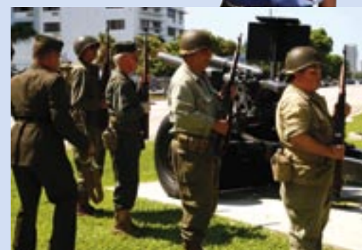
The Second Infantry Group