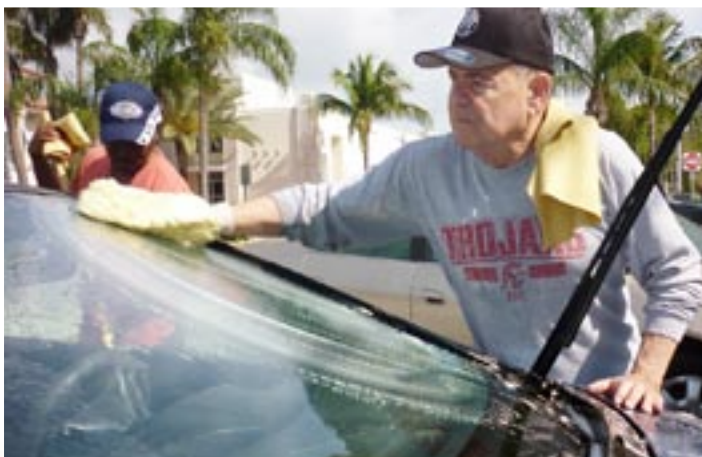
Members of the Northshore Kiwanis left cars squeaky clean at their annual Surfside carwash to raise funds for children's camps. The event was sponsored by the Surfside Police.