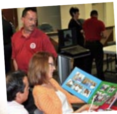
Keepsake book illustrates his achievements in Surfside.