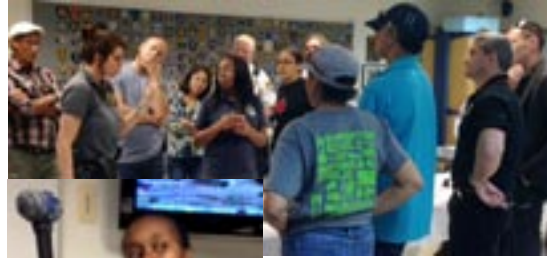
Students at the 12th Citizens Police Academy attend classes on SWAT tactics (left) and crime scene investigation (above).

The Surfside Police Department's Citizens Police Academy recently held its graduation ceremony for its 12th class. Graduates completed a series of 12 classes on topics such as aviation patrol, K-9 unit, crime scene investigations, marine patrol, driving range, firearms range, SWAT and crime scene investigation.