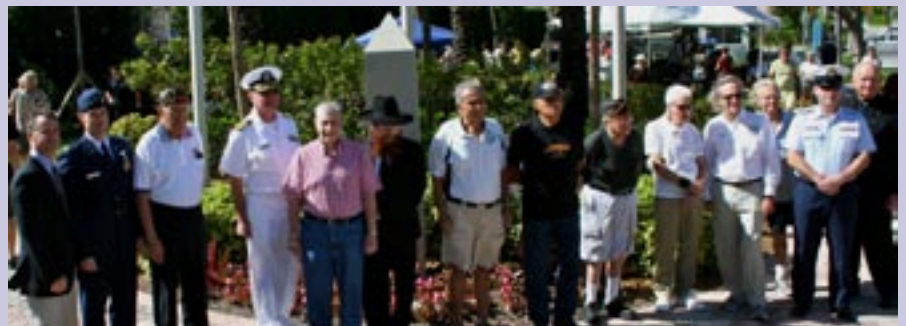
Surfside officials, visitors and veterans lay a wreath in honor of veterans