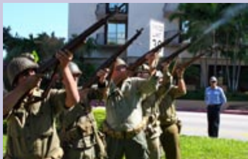
Three gun salute from the Second Infantry Division of Florida