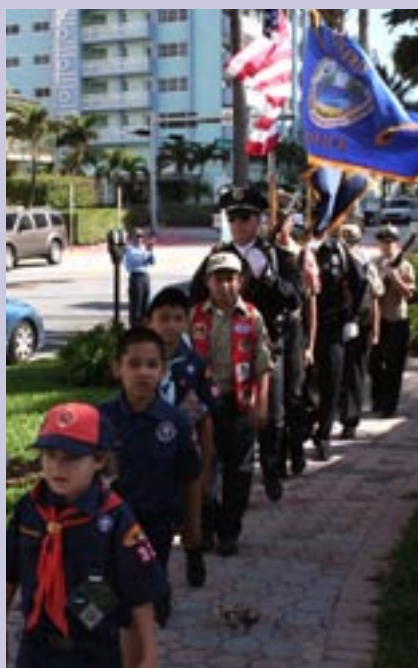
Scouts lead the Honor Guard