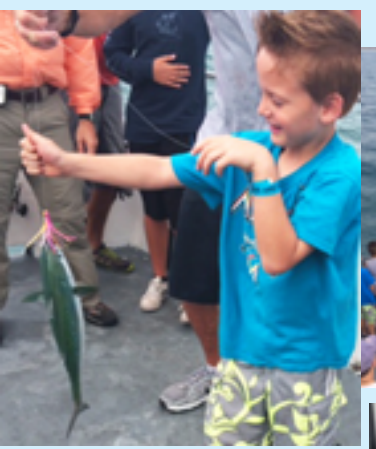
It was mostly smooth sailing for Surfside dads and sons at their May 3rd fishing trip out of Haulover Inlet. The Parks & Recreation event even resulted in the landing of several fish!