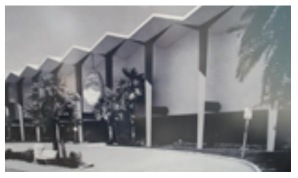
Surfside's first Community Center

the appearance of actress Jane Mansfield. The multipurpose rooms were then marketed by the Town for meetings and conventions to visitors while also