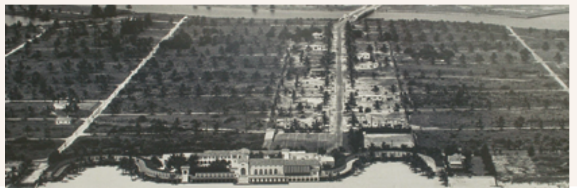
Information taken from •Miami-Then and Now. Arva Moore Parks & Carolyn Klesser, Thunder Bay Press, 2002. • 33154: The Story of Bal Harbour, Bay Harbor Islands, Indian Creek Village and Surfside. Seth H. Bramson.

Below: This aerial photo shows just a scattering of homes close to the Surf Club along Surfside Boulevard in 1933. In the distance is the bridge to Indian Creek Island and, at upper left, Bicaya Island.