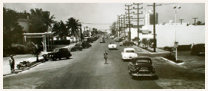
Looking north on Harding Avenue in the 1940s. At the upper right is Bal Harbour's Sea View, the only oceanfront high-rise of that era.

The group of visionaries who founded the Town of Surfside 80 years ago dreamed of a small, but self-contained Town that included quiet residential neighborhoods, resort facilities for seasonal tourists and wide variety of businesses in a central downtown. Through eight decades of growth and change, those dreams have come true.