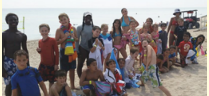
Surfside beach was where the boys and girls were for Spring Break 2015. The Parks and Recreation Department coordinated a week-long adventure for 6-12 year-olds that included plenty of water sports, obstacle races, sand castles, arts and crafts and cooking projects. Campers had a great break with their new friends.