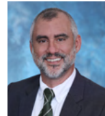
COMMISSIONER Gerardo Vildostegui