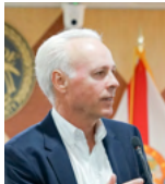
MAYOR Charles W. Burkett