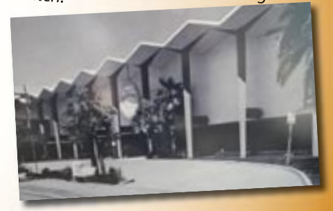
The former Community Center (above) and pool area at left.