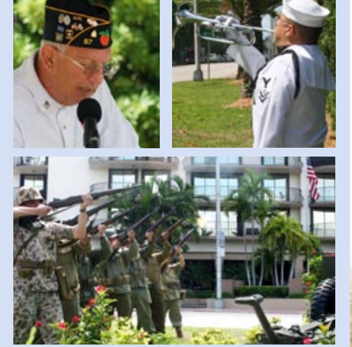
Surfside Gazette • JULY 2011

All times and dates, except Town Commission meetings, are tentative and subject to change. To verify, contact Town Hall at (305) 861-4863, visit the website www.townofsurfsidefl.gov or tune in to Channel 77.