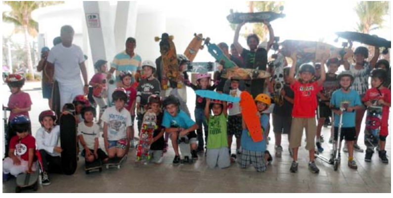
Dozens of Surfside youngsters enjoyed a special free skateboarding clinic at the Community Center where they learned techniques and safety procedures from skating experts. They also enjoyed a group skate around the Town.