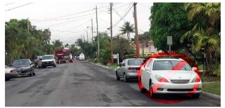
When parallel parking on a residential street, your vehicle MUST be facing the direction of traffic. Cars parked in the wrong direction are dangerous to pedestrians and the flow of traffic. Vehicles in violation will cited 24 hours a day/7 days a week.