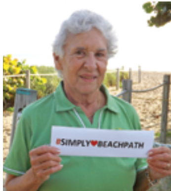
Commissioner Marta Olchyk #simply beachpath! As a Surfside resident, she finds herself starting the day with a peaceful walk along the path. The beach path is a local favorite for a stroll, run or walk. With the beach to the east and lush foliage to the west, Commissioner Olchyk enjoys the peaceful sounds of nature coupled with the great exercise.