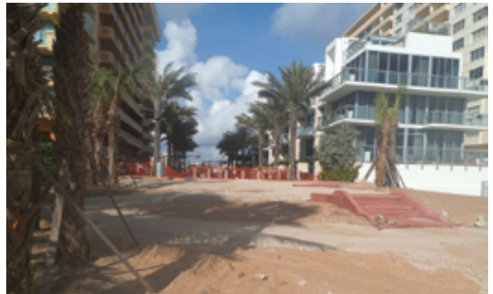
Looking from the beach at the 95th Street end project.

The Town Commission approved this project at the September Commission meeting. The foundation has been laid and the installation of stairs, sidewalks and swerving lime rock walkway will be done in the second phase. The new beach shower and pavers were delivered and Public Works began installation. The existing palm trees have been relocated and additional palms were planted on the north property line of the 9501 building. This project will complete the overall designed project, which started in August of 2013 with street improvements from Collins Avenue to the seawall with installation of drainage, pavers, street lights and new Medjool Palms. Phase 2 will be completed within 30 days with no cost to the Town as it is solely financed from proffers received from the property at 9501 Collins Avenue, which borders the north portion of 95th Street.