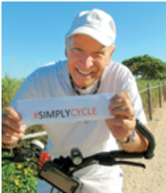
Vice Mayor Eli Tourgeman loves to #simplycycle! He often refers to the bike path and Surfside as a slice of paradise. He especially enjoys the perfect view and weather Surfside always seems to have. Each day Vice Mayor Tourgeman can be seen biking an impressive three miles.