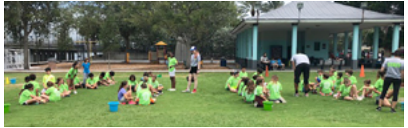
Campers ages 6-12 show off their skills during field day at the 96th Street Park.