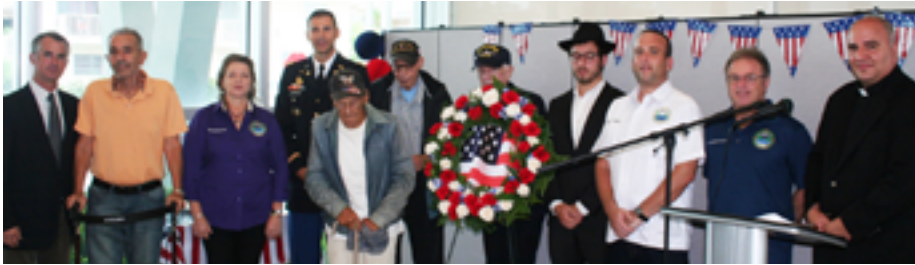
Veterans and officials present the traditional Laying of the Wreath.