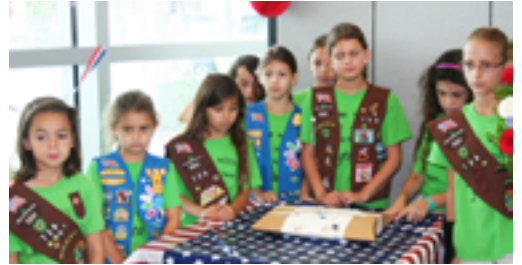
Girl Scouts Troup 739 present a Flag Burial Dedication.