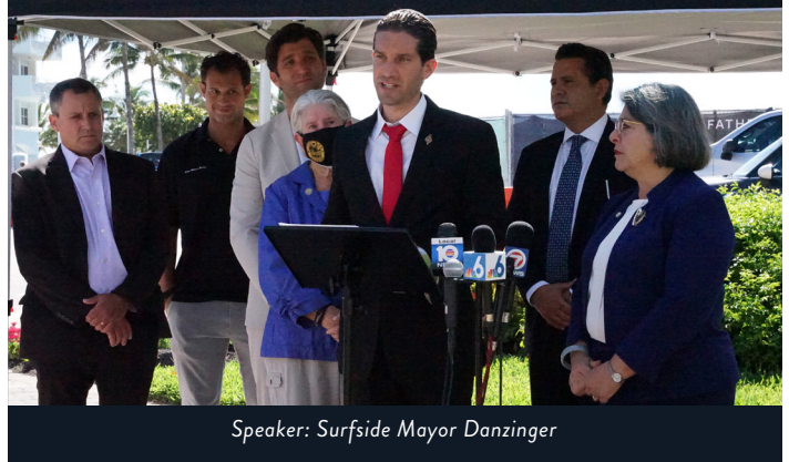
Speaker: Surfside Mayor Danzinger

A special permit from the Florida Department of Transportation (FDOT) was obtained to allow for the windscreen memorial which is located at the site along Collins Avenue and the hard pack.