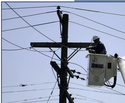
Overhead lines and poles (inset) would be replaced by above-ground access boxes located on property lines (shown at right)